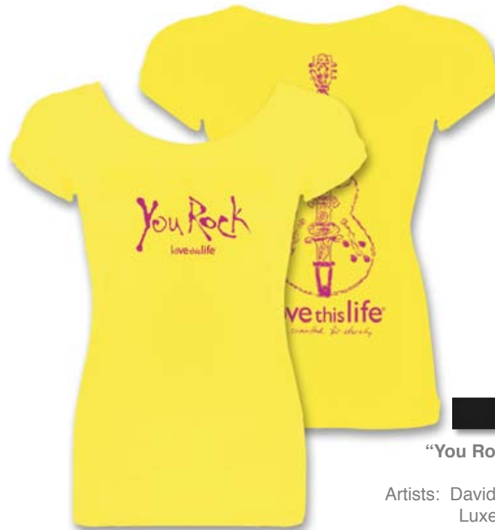
"You Rock Guitar" S/S Scoop