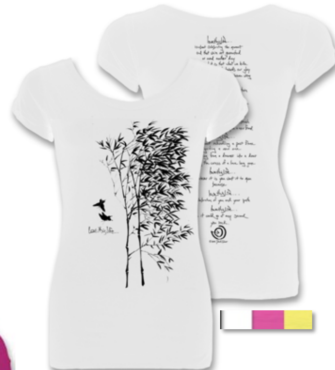
“Bamboo Manifesto” S/S Scoop