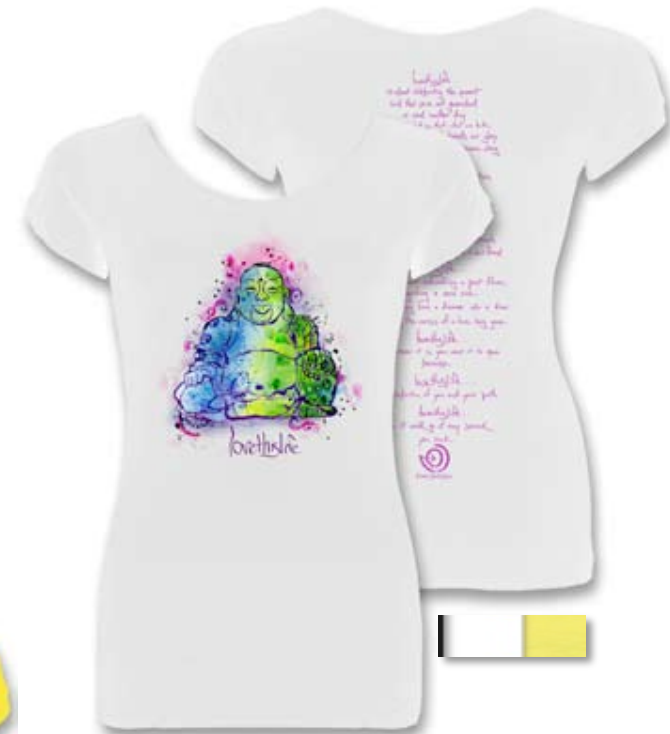
Watercolor "Buddha Manifesto" S/S Scoop