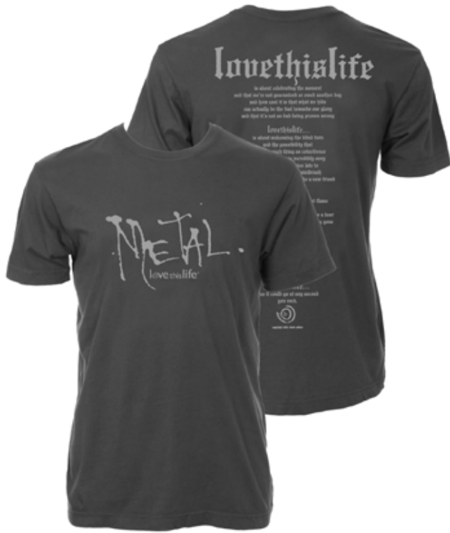
“Metal Manifesto” S/S Crew MET01CSS Artist: David Culiner 100% fine combed cotton Colors: black, charcoal, navy Sm – Xxlg $14

*Order your quantities accordingly as there's no extra inventory being produced for immediates or replenishment