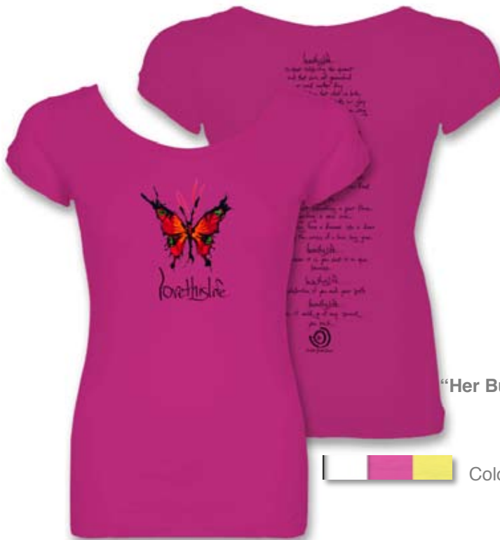
“Her Butterfly Manifesto” S/S Scoop