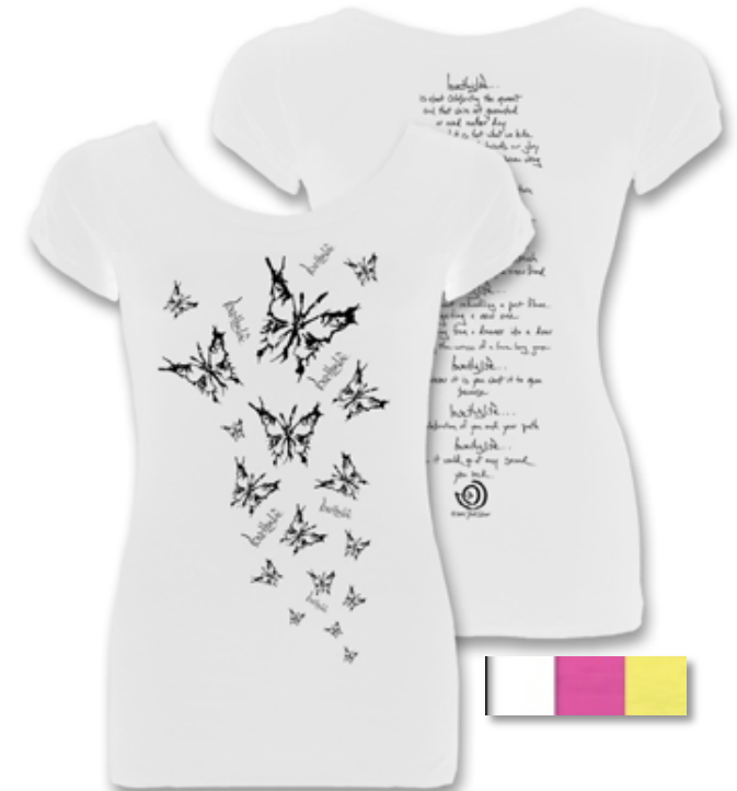
“Butterfly Storm Manifesto” S/S Scoop BUT02CSS Artist: Hannah Brobst Luxe 100% 50/1 cotton Colors: lemon, raspberry, white Sm - Xlg $18