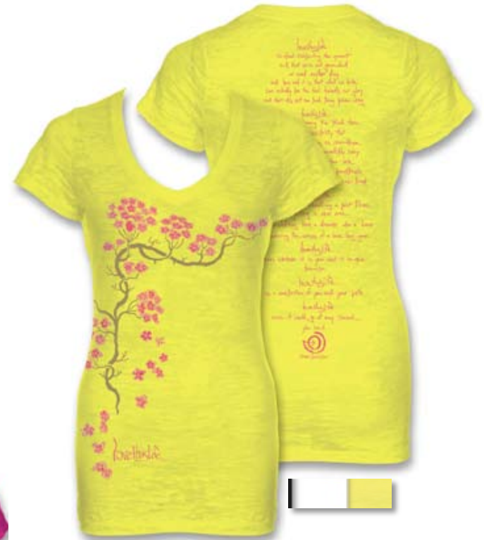
“Cherry Blossom Manifesto”