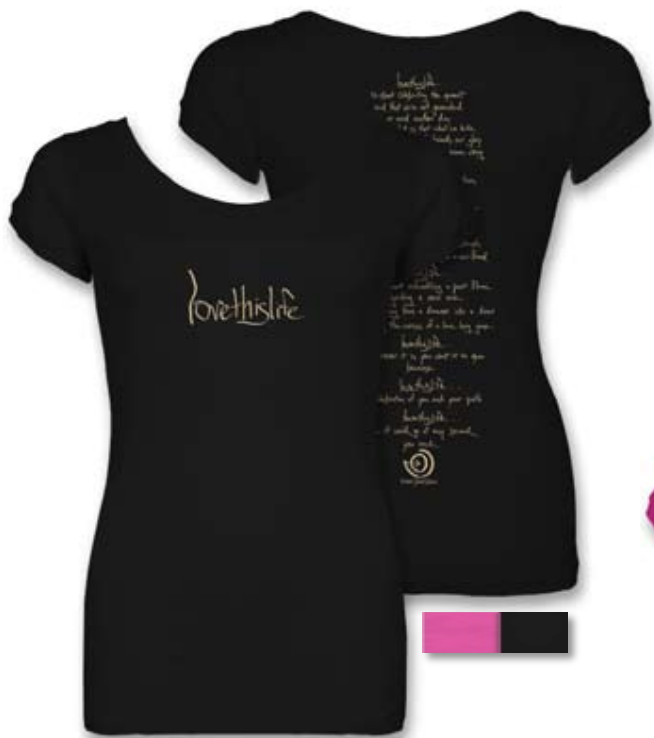
“Signature Manifesto” S/S Scoop

*Order your quantities accordingly as there's no extra inventory being produced for immediates or replenishment