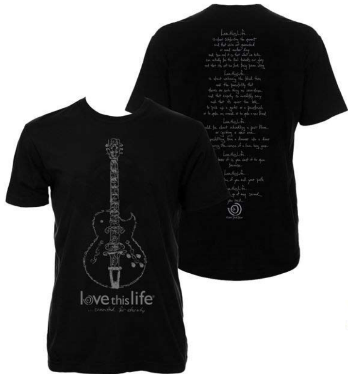
“David’s Guitar Manifesto” S/S Crew

*Order your quantities accordingly as there's no extra inventory being produced for immediates or replenishment