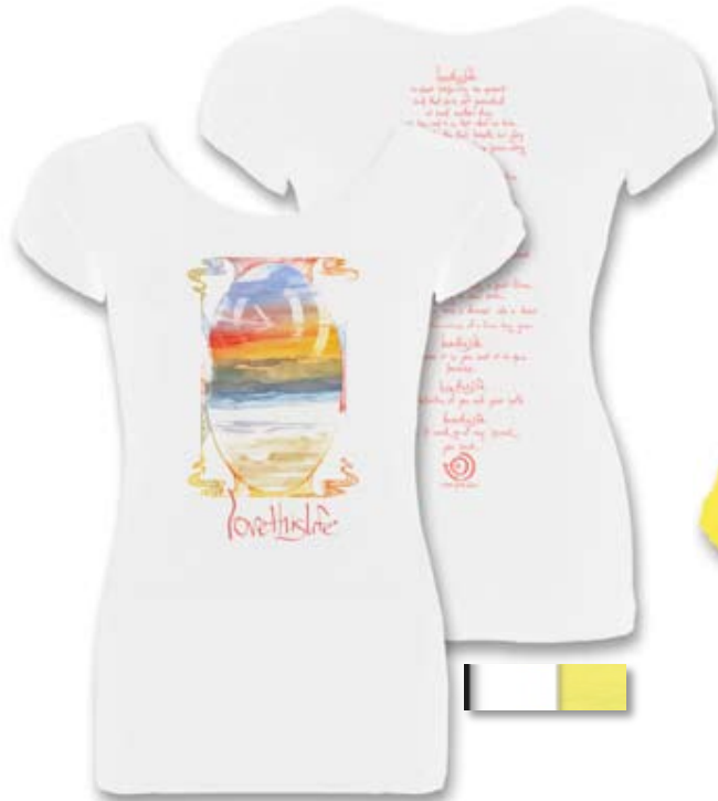
"Horizon Manifesto" S/S Scoop

*Order your quantities accordingly as there's no extra inventory being produced for immediates or replenishment