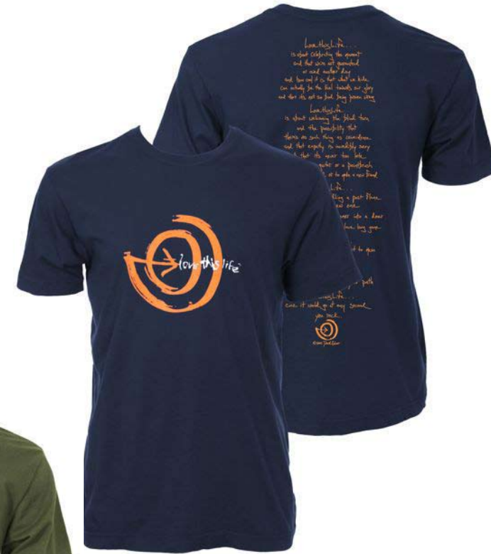
“2 Paths Manifesto” S/S Crew