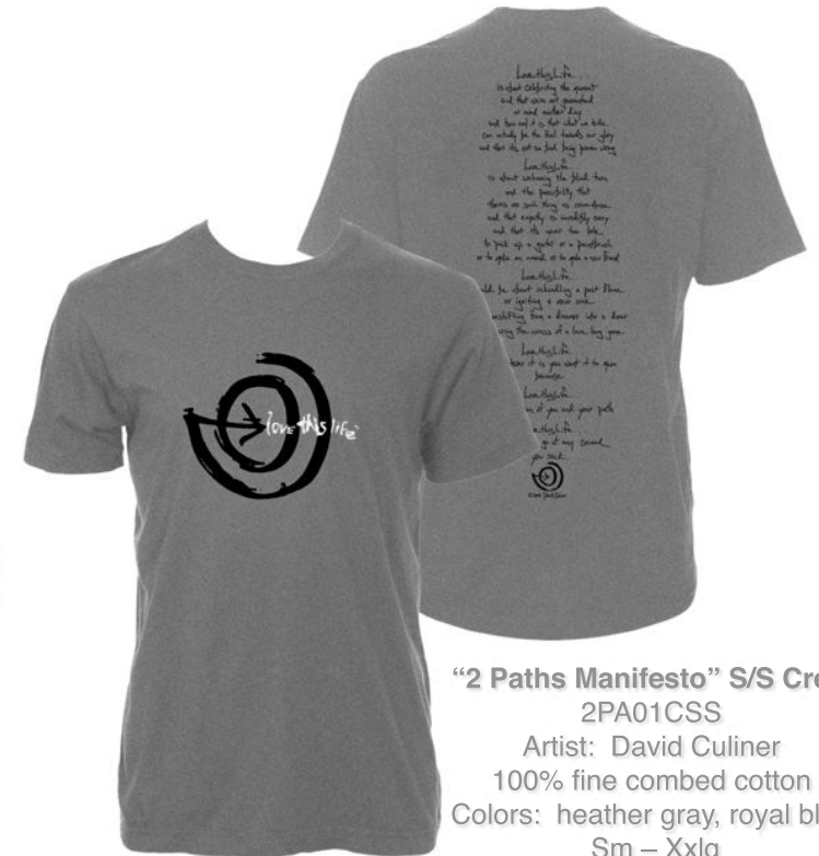
“2 Paths Manifesto” S/S Crew 2PA01CSS Artist: David Culiner 100% fine combed cotton Colors: heather gray, royal blue Sm – Xxlg $14