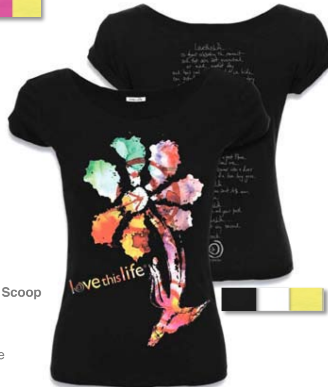
“Nightblossom Manifesto” S/S Scoop NIG02CSS Artist: Stan Doll Luxe 100% 50/1 cotton Colors: black, lemon, white Sm - Xlg $18