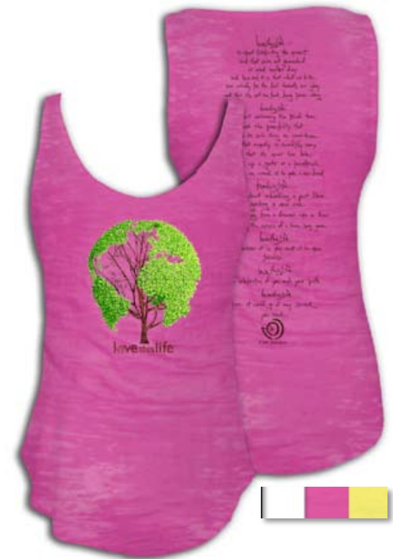
“Feathered Yin/Yang Manifesto” Luxe Burnout Tank FEA01TNK Luxe 50/50 cotton/polyester burnout Colors: lemon, raspberry, white Sm - Xlg $21