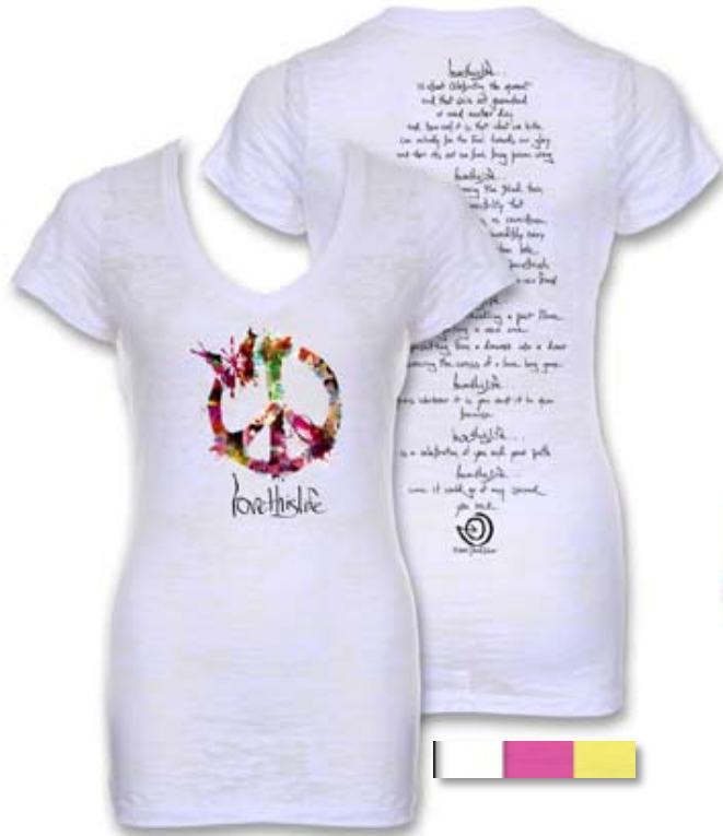
“Essence Of Peace Manifesto”

*Order your quantities accordingly as there's no extra inventory being produced for immediates or replenishment