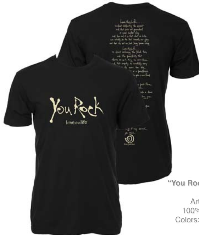
“You Rock Manifesto” S/S Crew YOU01CSS Artist: David Culiner 100% fine combed cotton Colors: black, charcoal, navy Sm – Xxlg $14