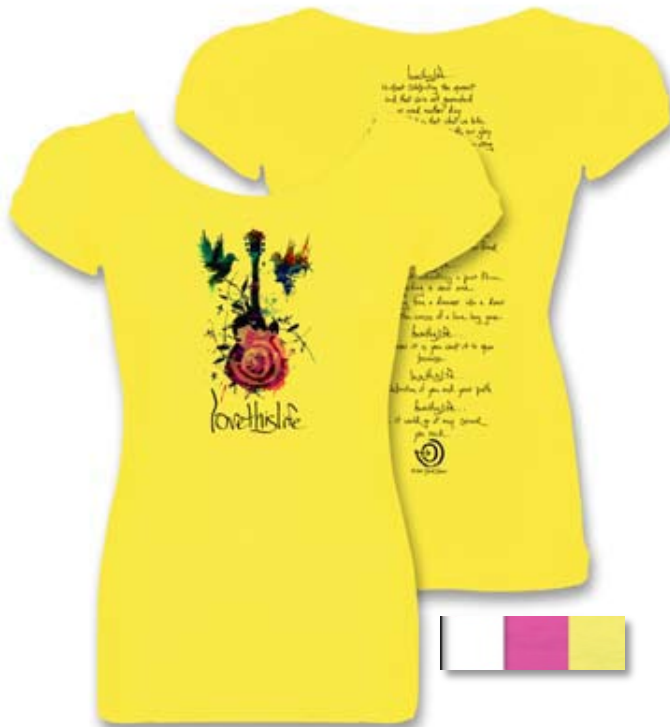
“Mid-Air Manifesto” S/S Scoop MID02CSS Artist: Stan Doll Luxe 100% 50/1 cotton Colors: lemon, raspberry, white Sm - Xlg $18

*Order your quantities accordingly as there's no extra inventory being produced for immediates or replenishment